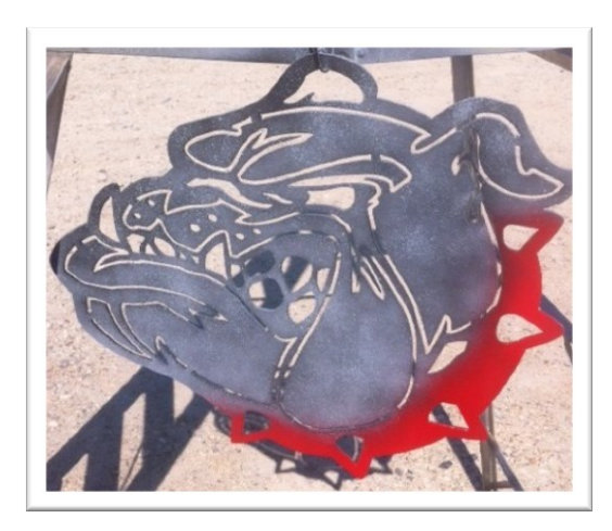
Ready for painting