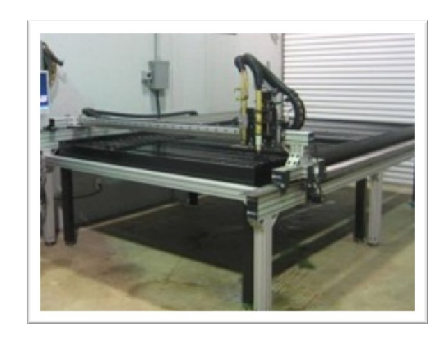
Plasma cutting table