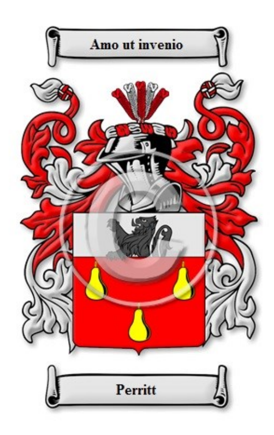
Personalized Family Crests